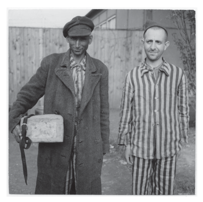
World War II. Detainees with a Red Cross parcel at Dachau concentration camp shortly after its liberation.

Rubli was in charge of convoy 36, which was held up at the border (23 Avril) by the Swiss authorities from 5 p.m. to 10 a.m. the following morning. The former detainees were forced to spend the night on the road, without blankets, hot drinks or food. Rubli also spoke of the lack of sanitary facilities and shelter and the transfer of the evacuees into third-class rail cars. Hof More generally and except for the work of a delegate by the name of Hort, who took it upon himself to provide first aid for 500 detainees in Landsberg, Hof LCRC made only a modest contribution to the various medical missions undertaken to save released detainees. For example, Jean Rodhain, chaplain general for prisoners of war and deportees in France, organised three medical missions to Bergen-Belsen, Dachau, Mauthausen and Buchenwald. The British Red Cross mobilized five teams in Bergen-Belsen, backed by British Quakers. The ICRC, for its part, dispatched a team made up of