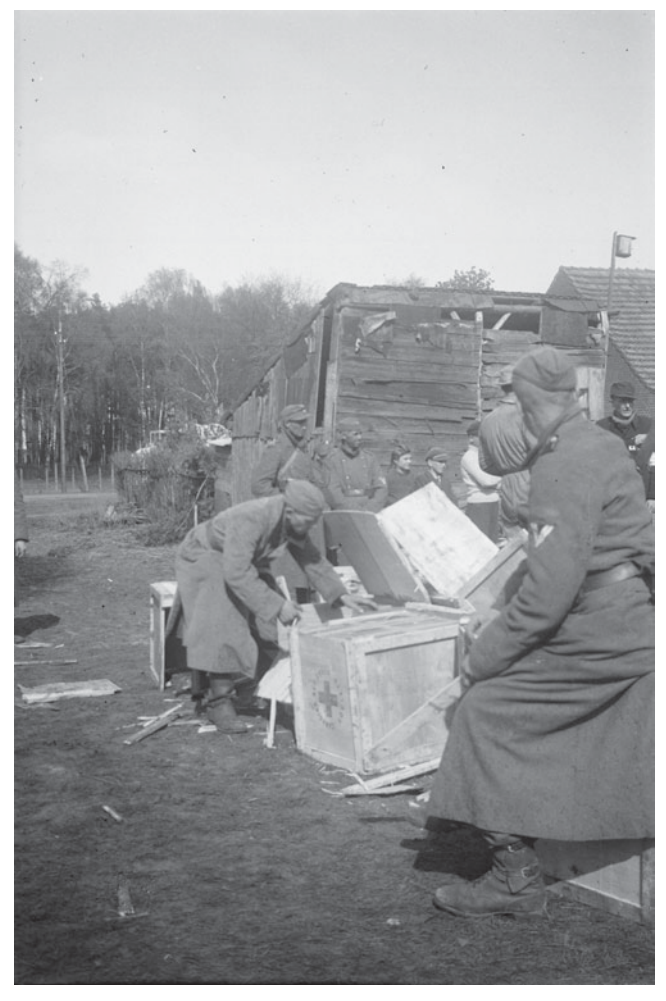
World War II. Death march from Oranienburg-Sachsenhausen to the Wittstock concentration camps. A crate of Red Cross parcels is opened by German guards.

managed to distribute a large shipment of parcels to evacuees.<sup>63</sup> According to the report from the ICRC Transport Service, the convoy made two distributions of food in Below Forest (on 27 and 30 April) of 56,000 kg each.<sup>64</sup> Those distributions were made pursuant to a request from SS-Obersturmbannführer Rudolf Höss.<sup>65</sup> This suggests that the Germans were using the relief supplies to facilitate the detainees'