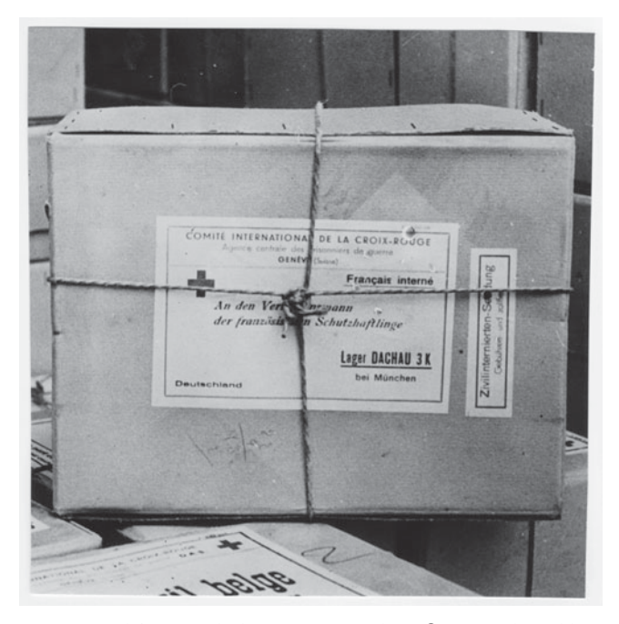
World War II. ICRC parcel for French deportees at Dachau.