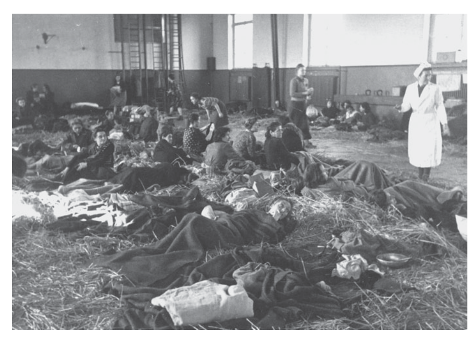
World War II. Kreuzlingen. Detainees from Ravensbrück concentration camp are housed in a gym after their evacuation by the ICRC.

starving inmates of the camps.<sup>104</sup> Rich in proteins, sugar and vitamins, the food was hard to digest to the point that it killed some of the weakest detainees. More generally, the ICRC does not seem to have given real thought to the detainees' actual health needs. The organisation took one improvised initiative after another, often in a clumsy manner and without giving special consideration to the specific needs of the people involved. The operations to repatriate detainees from Ravensbrück and Mauthausen were an example of this, revealing as they did what little attention the Swiss authorities paid to the extraordinary circumstances of the deportees struggling to survive the concentration camps. In the report he filed on his return from Mauthausen, ICRC delegate Rubli complained bitterly of the conditions in which the evacuees were received in Switzerland, which he considered 'scandalous'.<sup>105</sup>