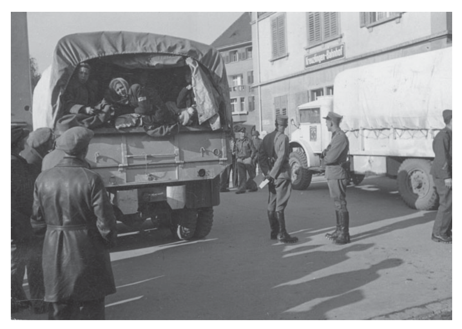
World War II. Kreuzlingen. 300 women released from Ravensbrück concentration camp arrive in Switzerland on board ICRC trucks.

Polish^{74} female detainees in exchange for the release in France of 454 German civilians.<sup>75</sup>