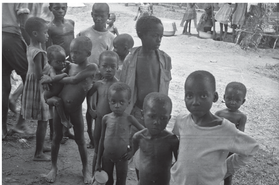
Figure 6. Refugee children of the Nigeria–Biafra war, Awo Omama camp. This photograph appeared in International Review of the Red Cross , No. 595, July 1968.

In addition to these measures, the ICRC did not hesitate to use the articles published by journalists or even by some of its volunteers to generate interest in its activities, for instance by reproducing them in the International Review of the Red Cross . 100 The ICRC therefore appeared relatively tolerant of the public statements made by its volunteers when they fit in with its communication policy. The ICRC went even further when it assigned a journalist from the Neue Zürcher Zeitung to its delegation, who was then tasked with negotiating the resumption of the airlift in the autumn of 1969. However, since the Committee did not deem the outcome of this experience to be particularly favourable for the organisation, it did not repeat it. 101 In late 1969, the new president decided on a new-look policy for the ICRC’s media relations in order to raise the organisation’s profile among reporters. 102 Finally, the conflict prompted the ICRC to rethink its position on publicly denouncing belligerents for their role in the suffering of the population. With some staff members calling for the ICRC to publicly denounce the Nigerian government’s bombings of civilian targets, the organisation decided to draw up more precise