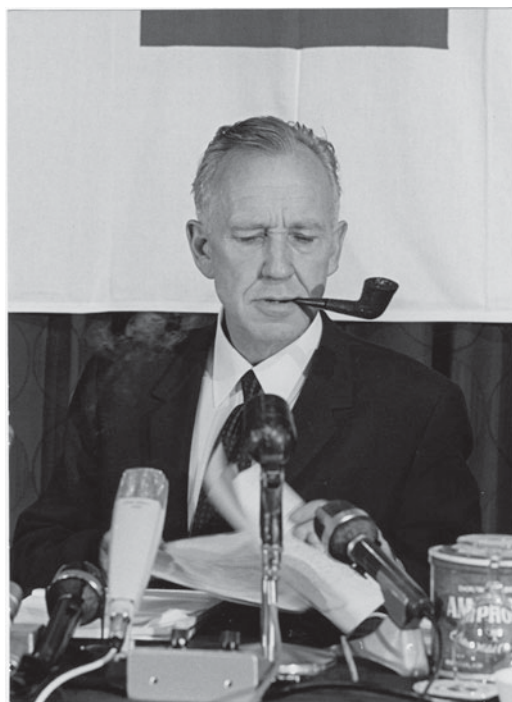
Figure 5. Auguste Lindt at a press conference on Biafra, Geneva, 14 August 1968.

The ICRC also produced two films, one on Biafra and the other on Nigeria, which it distributed to National Red Cross Societies as well as to the public in order to showcase its activities in the conflict. In the spring of 1969, Lindt was featured in the British television show The Man of the Month . The use of visual resources was not new to the ICRC, which regularly produced films about its activities and had used photographs in its publications for many years. However, there was an increased awareness of the importance of pictures for disseminating information about the ICRC: