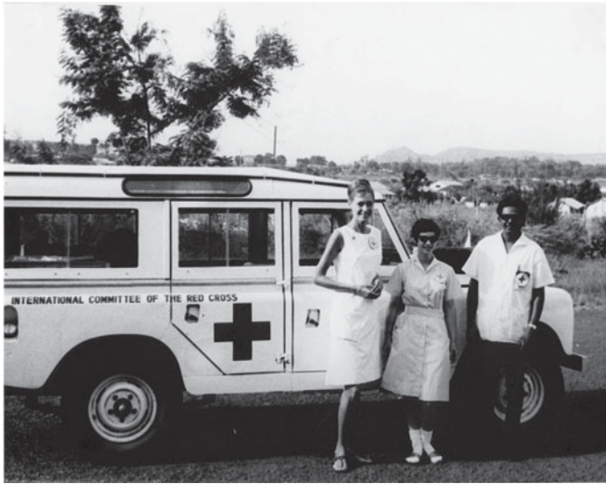
Figure 3. A medical team from the Lutheran Church-Missouri Synod, Biafra, July 1968.

and aircrews, the American, Dutch, Swiss, and Yugoslav Red Cross Societies provided the ICRC with medical and technical staff. 62 Around 70 people working for the ICRC's operations had been sent by the Salvation Army, Oxfam, the World Council of Churches, the Lutheran Church–Missouri Synod, the Save the Children Fund, and the International Union for Child Welfare. 63 As well as this cooperation between various Western organisations, the Nigerian Red Cross Society was increasingly involved in the ICRC-coordinated operation. (Fig. 3)