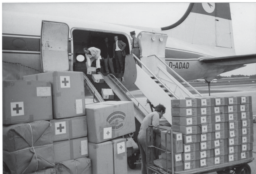
Figure 1. A DC4 in Geneva loading 6.5 tonnes of medicines and vitamins for Biafra via Santa Isabel, 27 May 1968.

the blockade imposed by the federal government. These efforts, made in haste and without informing the Nigerian government, only exacerbated the misunderstandings with the authorities. 32 The ICRC's amateurism not only hindered negotiations about the relief effort in Biafra, but also affected the management of the operation on Nigerian soil. With thousands of tonnes of aid sent by governments and organisations beginning to arrive in Lagos, the ICRC struggled to coordinate its distribution. (Fig. 1 & 2)