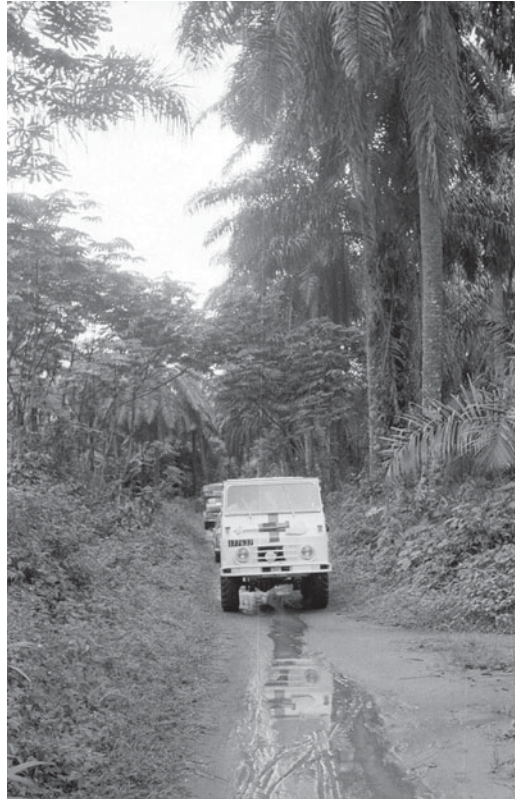
Figure 2. A convoy in the Nigeria–Biafra war.

to the head of the International Organisations Division, 14 June 1968, DDS, dodis.ch/33772. 34