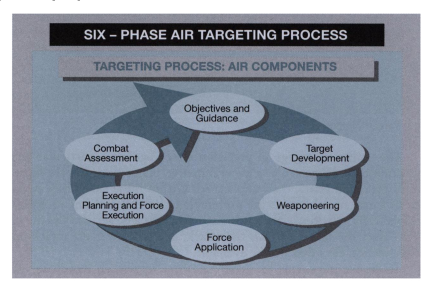
Figure 2: Targeting Process<sup>23</sup>

This six-phase process commences with the commander setting campaign objectives and issuing corresponding guidance to his or her forces. Once received, target development can begin. During this phase, the enemy's military, political and economic systems, their subcomponents and their interrelationships are studied. The value of potential targets is analysed to determine the relative need to strike them, and international humanitarian law and rules of engagement factors are considered.