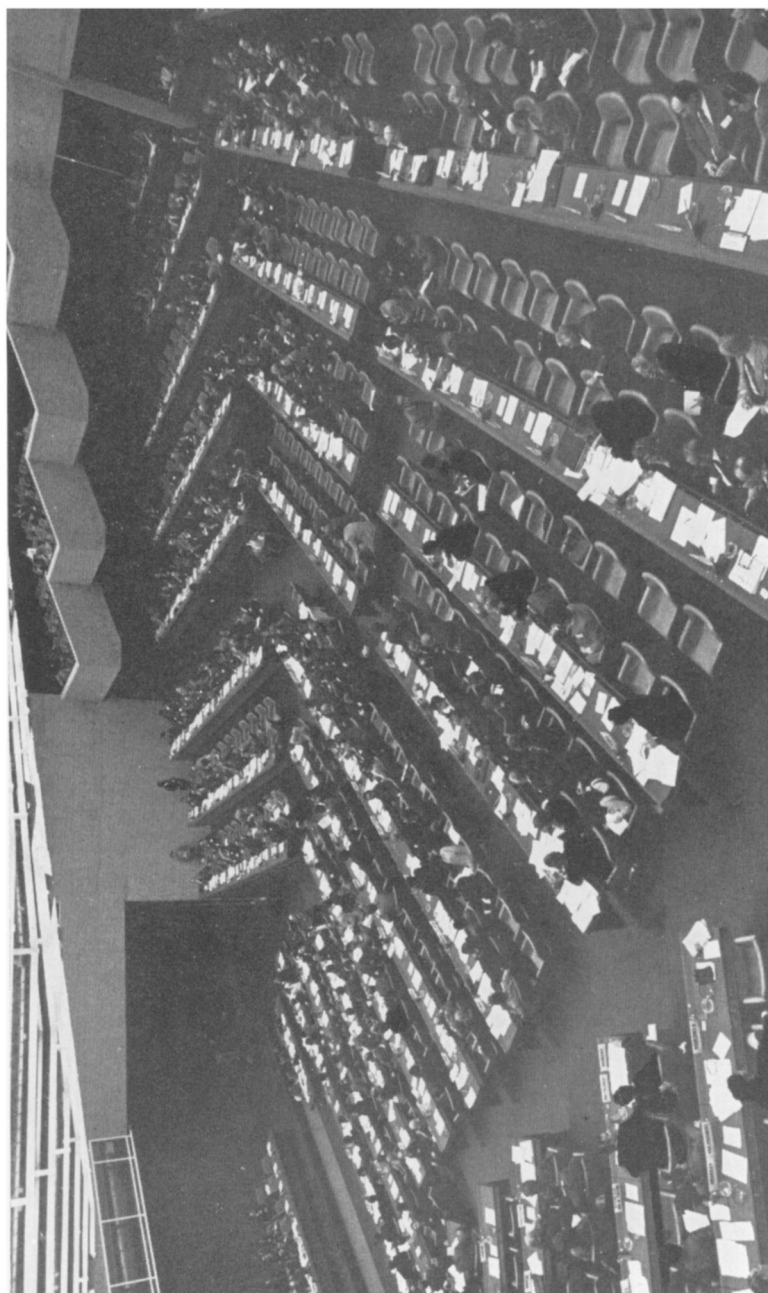
Geneva, February/April 1975 : Second session.